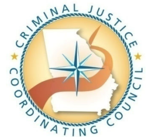
BJA Performance Measurement Tool (PMT)